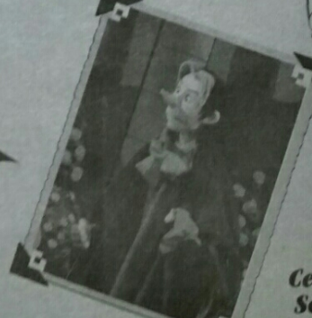
Cedric the Sorcerer

Showing her school spirit in the Pixar Play Parade. But beware, this undercover slug is "always watching!"