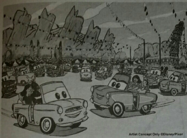
Artist Concept Only

Citizens of Cars Land have been speculating on what is happening behind the walls in Radiator Springs. Well, listen up, boys and girlie girls, we've got the scoop right here! We were told that our favorite Fiat, Luigi has been vacationing in Italy. But, according to Radiator Springs news reporter Otto Anchor, "Some exciting news has just coasted into Radiator Springs". Otto reports that "Luigi has invited all of his