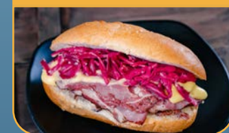
Pacific Wharf Café

Subject to availability. Valid park reservation and ticket for appropriate park required to pick up mobile order. Separate admission to certain locations may also be required.