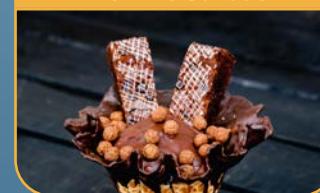
Clarabelle's Hand-Scooped Ice Cream